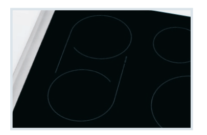
SpaceWise<sup>™</sup> Bridge Element A flexible element lets you combine two seven-inch elements into one to fit larger cookware.